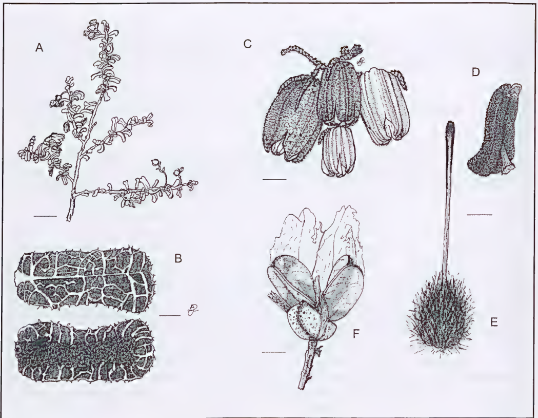
Figure 1. Guichenotia anota C.F.Wilkins. A – habit; B – leaf adaxial (above) and abaxial (below) surfaces; C – inflorescence of pendulous flowers; D – anther with poricidal dehiscence; E – ovary and style with stigma broader than style; F – fruit a loculicidal capsule with calyx remains. From C.F. Wilkins 1122. Scale bars A & B = 1 cm; C = 0.25 cm; D & E, = 0.05cm; F = 0.1 cm.